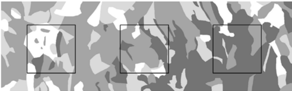
Figure 1. Sampling design using windows in a landscape where natural and human actions cause a mosaic of different vegetation types (in this case four vegetation types, increasing modification from dark to light colors). The windows (black frames) serve as representative samples of the landscape. This example shows a disturbance gradient between windows where the original vegetation (dark gray) persists in each window to different extents, just as the modified ones. The sampling design within windows depends on the group of organisms studied; there are options for random, proportional or equal sampling in each vegetation type.

To return to the initial question of how the landscape should be studied, a historical analysis reveals that according to Whittaker (1960, 1972), for years the measures of alpha and beta diversity referred to types of vegetation or to comparisons between types of vegetation. However, with the growing fragmentation and modification of landscapes, reference to only vegetation types gives an incomplete idea of the heterogeneity and structure of the actual landscape. In most cases, mainly in tropical landscapes, there are a multitude of different types of land use and vegetation. To analyze this type of situation, we propose the landscape be sampled using a certain number of “windows” (Rös et al. 2012). These windows are equivalent spaces, randomly situated or placed to maximize representativeness, throughout the landscape (Fig. 1). They are sampling units that reflect the heterogeneity of the landscape, which is spatially unequal. In the study of the impact of humankind on landscapes it is of less importance to know what type of use is favorable or damaging for the communities of plants and animals than it is to know the overall impact of all types of use together and natural vegetation types on them. This set of effects is best studied using windows. The values of diversity obtained in each window are treated as alpha diversity. One comparison between windows will reveal the different degrees of heterogeneity in the