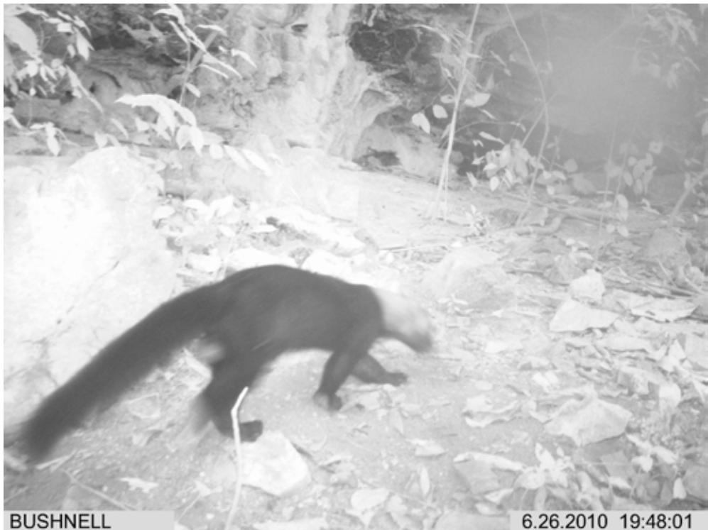
Figure 1. Photograph of a Male tayra in the municipality of Zihuateutla in Puebla, México.

Additionally we found a specimen (a mounted skin) in the region of Zapotitlan de Mendez (2212264 N / 634494) in the northern part of the state. The individual was a sub-adult female hunted approximately 5 years ago (circa 2005). The person declared