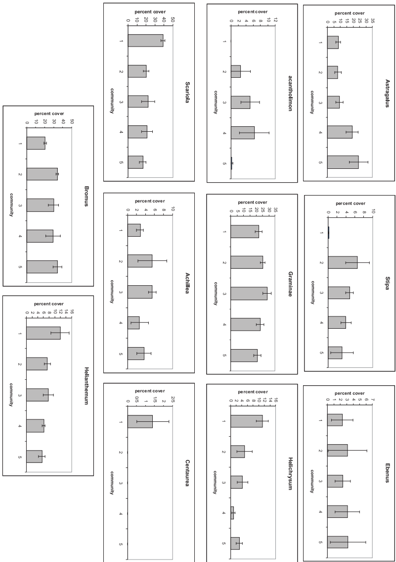
Figure 1 Mean \pm S.E. of percentage cover of vegetation variables in each habitat type (=vegetation community). The community 1: Scariola/ Astragalus/ Ebenus/ Achillea/ Centaurea ; the community 2: Astragalus/ Artemisia/ the community 3: Astragalus/ Ebenus/ Stipa/ Helichrysum/ Scariola ; the community 4: Astragalus/ Ebenus/ Stipa/ Artemisia/ Acantholimon ; and the community 5: Astragalus/ Stipa/ Ebenus/ Acantholimon .