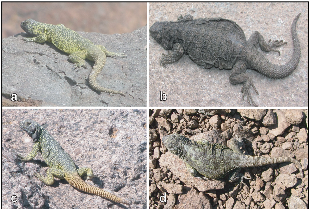
Figure 1. Dorsal view in life of some specimens studied. a) P. damasense (Holotype, SVL= 105.1 mm). b) P. damasense , (Female SSUC Re 0410; SVL= 112.6 mm). c) P. maulense , (Male topotype MZUC 35960; SVL= 92.8 mm). d) P. darwini , (Male, SSUC Re 125; SVL= 86.8 mm).

From P. “adrianae” , it differs in that female of this species have no precloacal pores or dark bars on the flanks. Females of P. “adrianae” have white on the sides of head (“white face”). The preocular scale