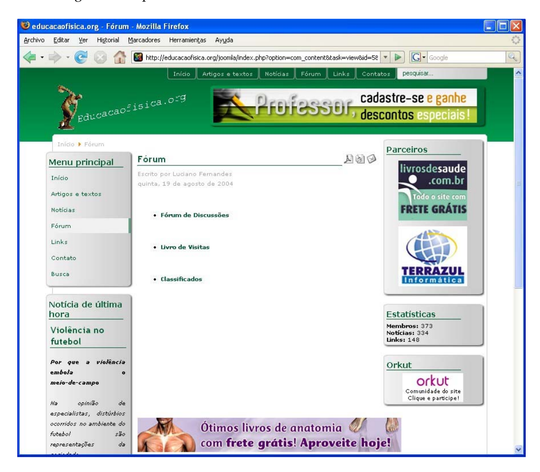
Figure 3. Internet Forum of Physical Education 2008 -

The second is the Educacionfisica.org that presents the following themes: gymnasiums and physical activity centers; physical activity and mental health; biomechanics; physical education at schools; physical education in general; sports; physiology; leisure and recreation; body building; nutrition; obesity and slimness; sport psychology; sport training; courses, lectures and events; jobs; sport events; interesting sites and products and services.