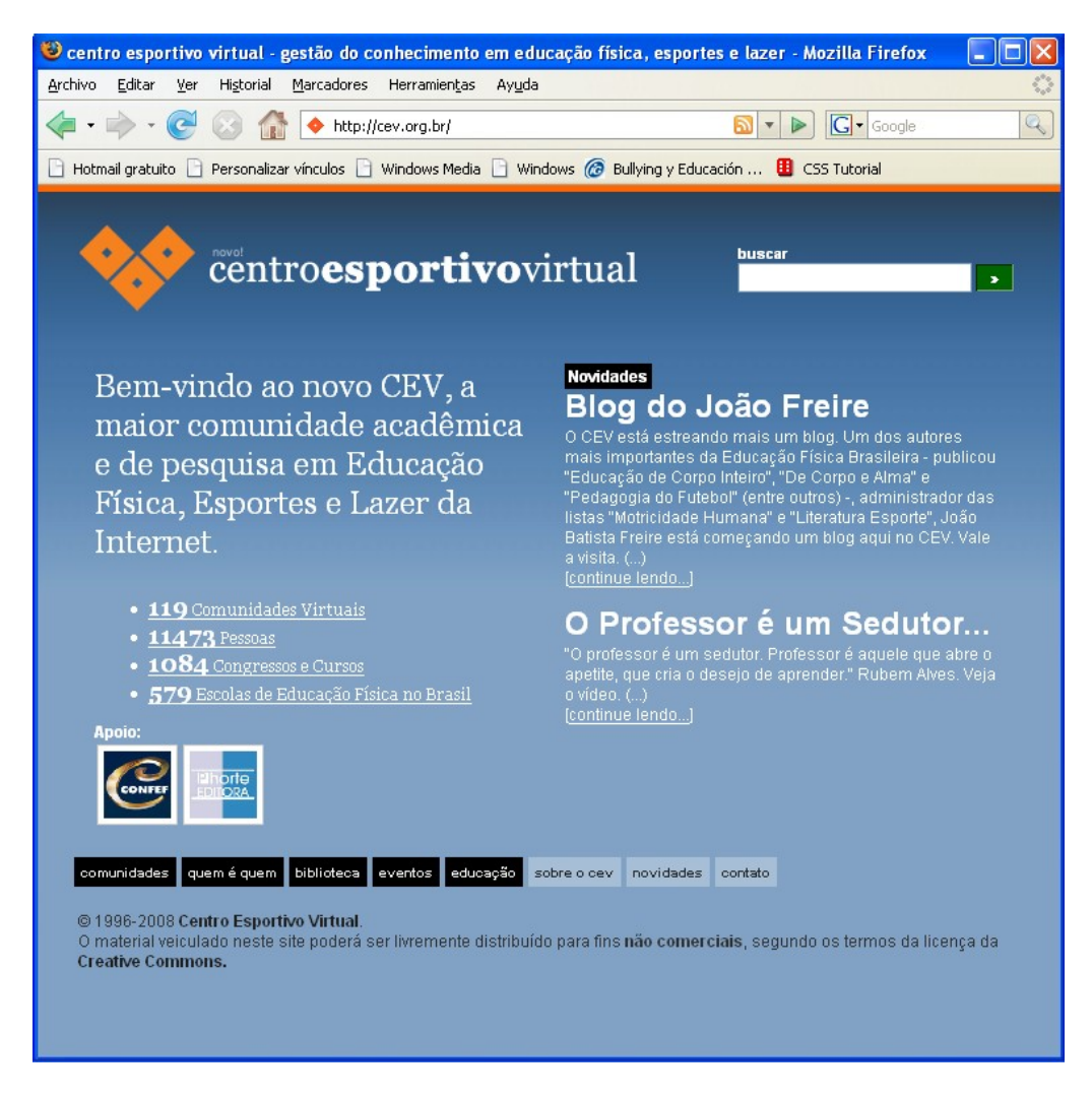
Figure 1. Virtual Sport Center - http://cev.org.br/comunidade/

The Brazilian discussion lists in Physical Education and Sport are available in Virtual Sport Center [Centro Esportivo Virtual] (CEV).