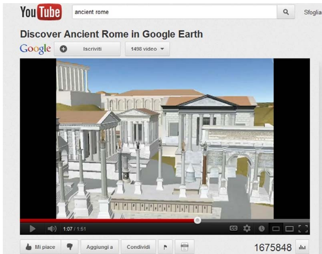
Figure 3. Channel ANCIENT ROME on Youtube realized with 3D virtual reconstruction on Google Earth.

Using Google Earth you can create 3D virtual tours and virtual three-dimensional reconstructions of architectural sites, urban centers, touristic sites, cultural sites, landscapes, etc. In November 2008, ANCIENT ROME opens on Youtube ( http://www.youtube.com/watch?v=MqMXIRwQniA ). This channel, born through a collaboration between YouTube, Rai.tv and Past Perfect Productions, will show several documentaries about the eternal city (Figure 3), with the obvious purpose of finding new and inventive ways to give students the opportunity, today as well as tomorrow, to continue studying Roman history and Roman buildings. In 2009, this project became part of Google Earth software, with a documentary including the 3D virtual reconstruction of the city, navigable, that restores the image of how the city presented itself in 320 AD.