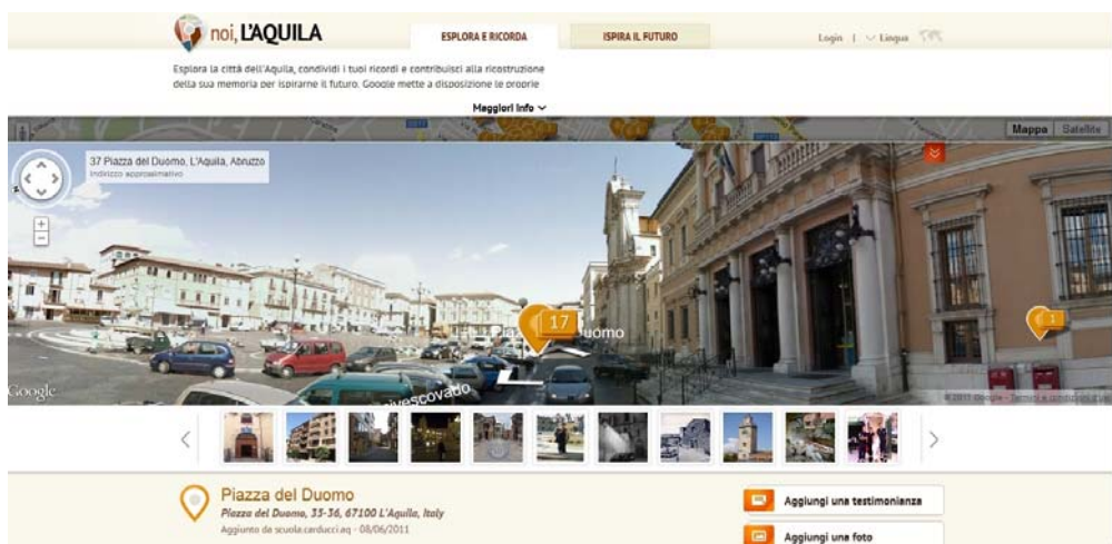
Figure 5. A 360 degrees visualization of the Duomo of L'Aquila with UGC posted on Google Street View.

Google, which has donated the project to the City of L'Aquila and to the ANFE, has provided the city and its inhabitants its technology, facilitating the collection and creation of stories, memories, videos and photos provided and shared by users (Figure 6), for preserving memory of L'Aquila and its significant artistic and cultural heritage through geo-tagged data. This idea, that is a wonderful example of geo-social digital tagging with user generated contents, useful to write “stories on geographies” (Bonacini, 2013), is also a real pilot project that Google intends to make available to all communities of the world affected by natural disasters. Japan, for example, is already among the first countries to have implemented it.