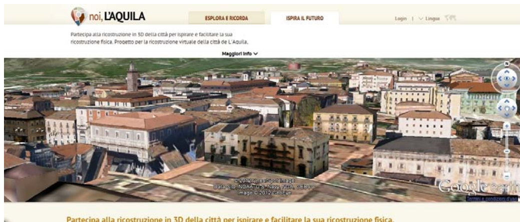
Figure 4. A 3D photo-textures reconstruction of L'Aquila historic center realized with Google SketchUp on Google Earth.

Connected with the project Come Facciamo is the website www.noilaquila.it ("We L'Aquila": Figure 5), a web technology platform, based on Google Map with Street View service, launched in June 2011 for the three-dimensional virtual reconstruction of L'Aquila, whose motto is "Sharing the memory to reconstruct the future". The site is organized and implemented in collaboration with Google, creator of the project, the Community of L'Aquila and the National Association of Families Emigrants (ANFE) that is run by its delegation in L'Aquila.