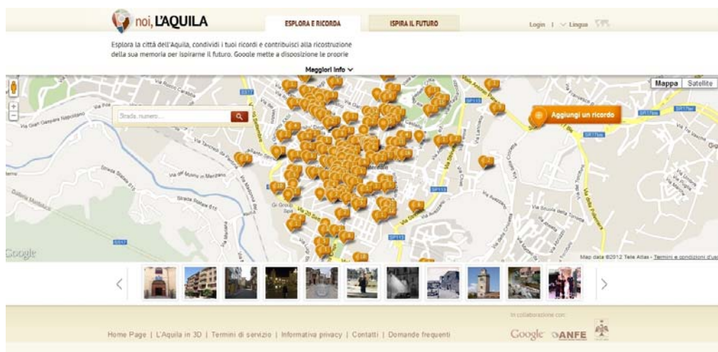
Figure 6. UGC signed in the map of L'Aquila's on Google Map.

Google, which has donated the project to the City of L'Aquila and to the ANFE, has provided the city and its inhabitants its technology, facilitating the collection and creation of stories, memories, videos and photos provided and shared by users (Figure 6), for preserving memory of L'Aquila and its significant artistic and cultural heritage through geo-tagged data. This idea, that is a wonderful example of geo-social digital tagging with user generated contents, useful to write “stories on geographies” (Bonacini, 2013), is also a real pilot project that Google intends to make available to all communities of the world affected by natural disasters. Japan, for example, is already among the first countries to have implemented it.